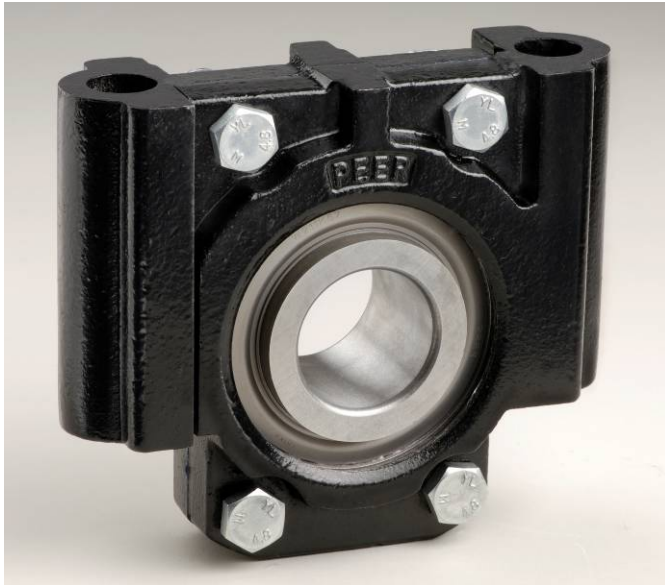
Pillow Block Style